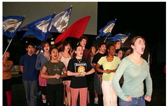
Some of the Chess cast in rehearsal

Chess —a smash-hit on both London and Broadway stages—is coming to the Frost, March 22-25. The collaborators on Chess are giants of rock and rock musicals. Tim Rice wrote the lyrics and the music is by Björn Ulvaeus and Benny Andersson, formerly of ABBA. They've created a complex, exhilarating rock opera that, against the backdrop of the cold war, explores how an ancient game becomes a metaphor for romantic rivalries, competitive gamesmanship, super power politics and international intrigues.